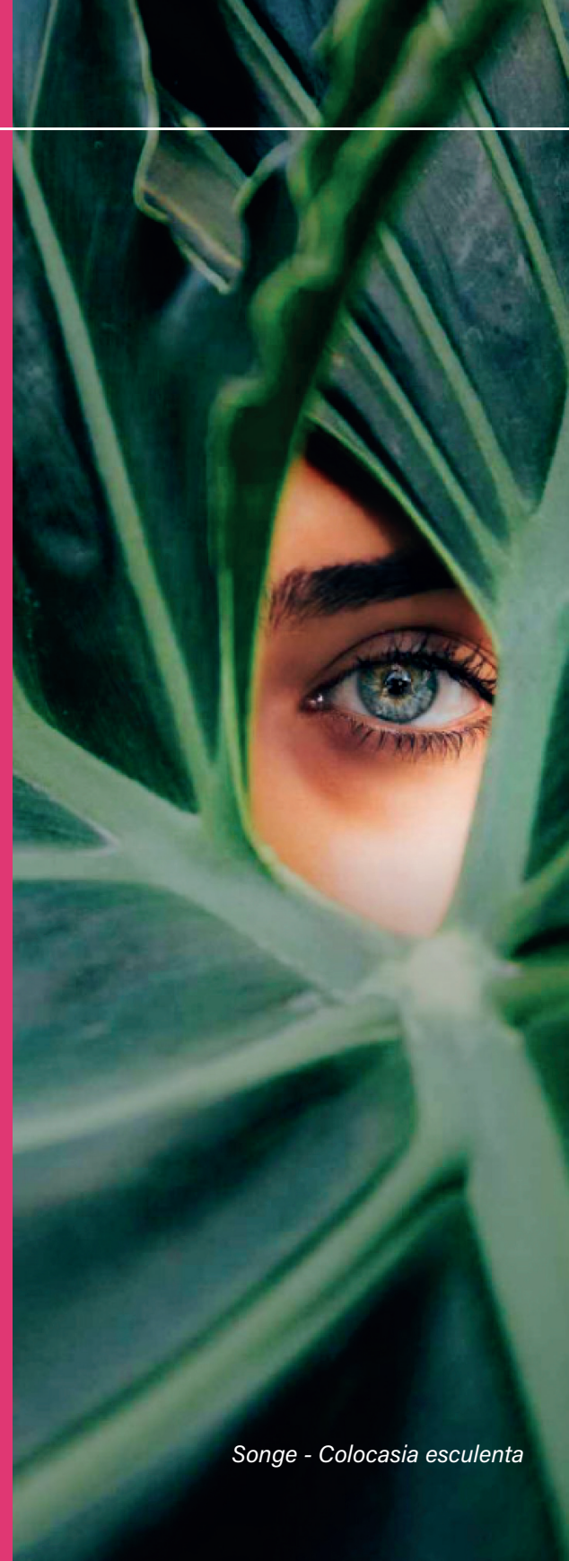
Songe - Colocasia esculenta