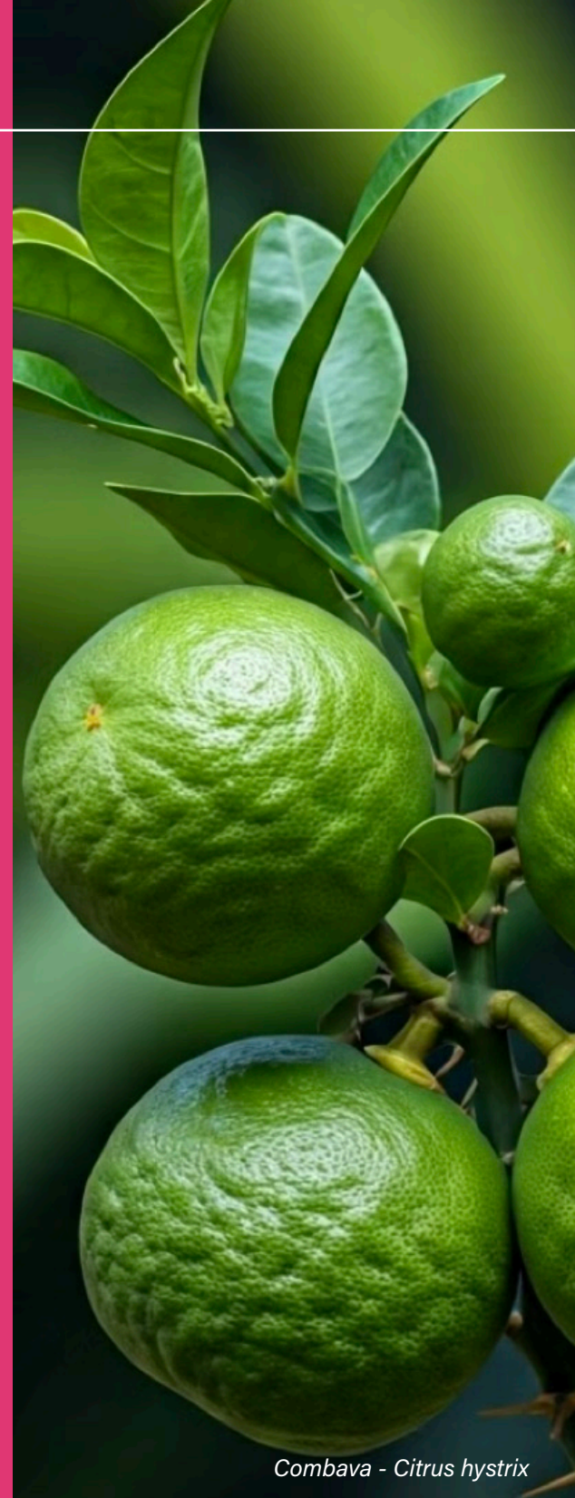
Combava - Citrus hystrix

La Réunion has a high genetic diversity that allows plant populations to better adapt to climate and environmental change.